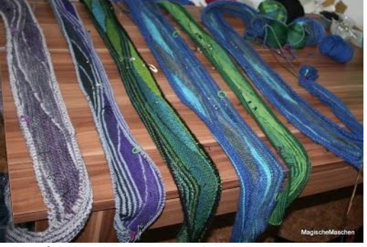
Beautiful shawls were started in the Live Class in Saarbrücken, Germany, October 2012

Friday (13<sup>th</sup>): 2 p.m. to about 9 p.m. Saturday (14<sup>th</sup>): 10 a.m. to about 9 p.m. Sunday (15<sup>th</sup>): 11 a.m. to about 3 p.m.