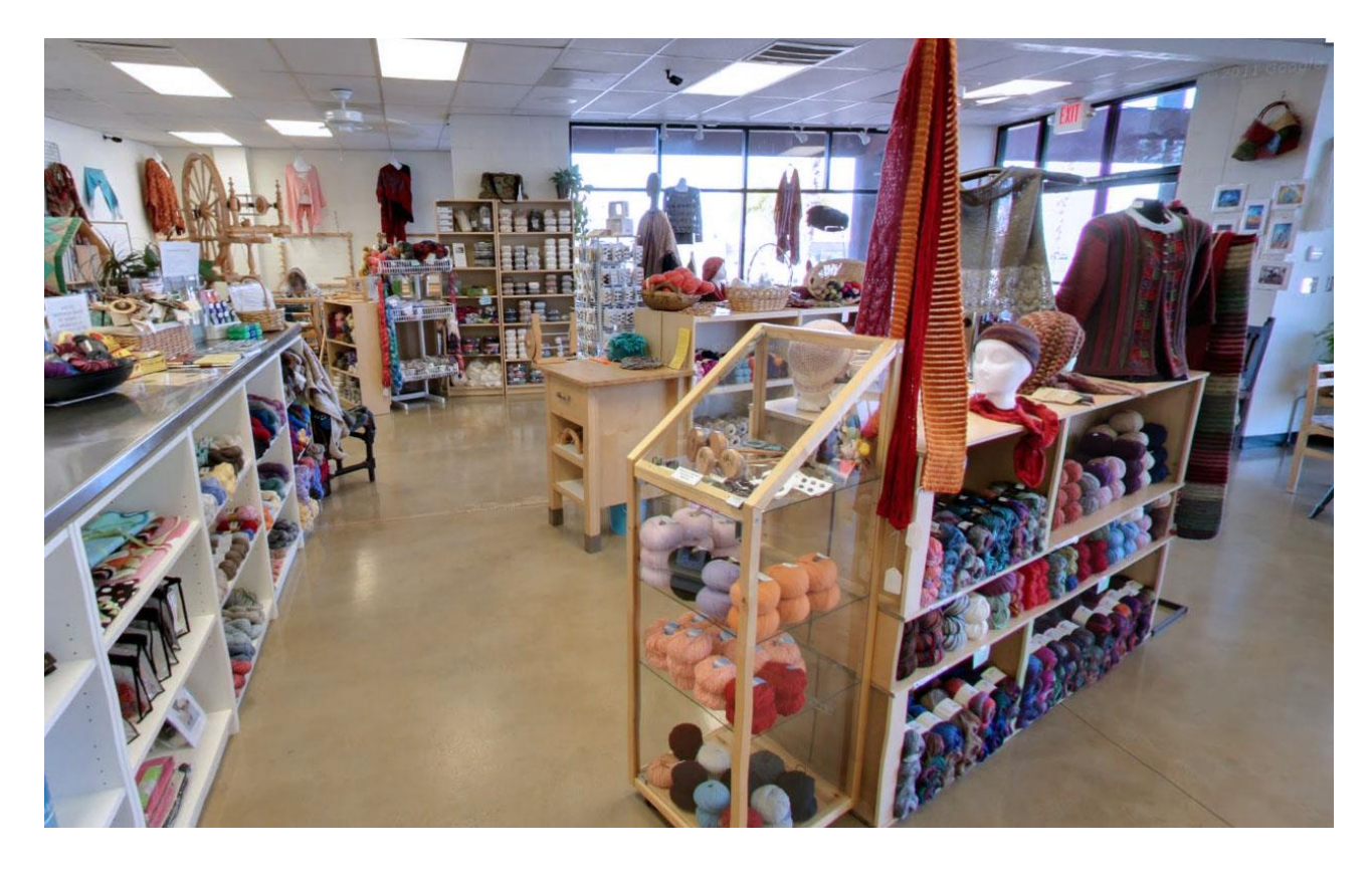
We look forward to having you become part of the Tempe Yarn community.